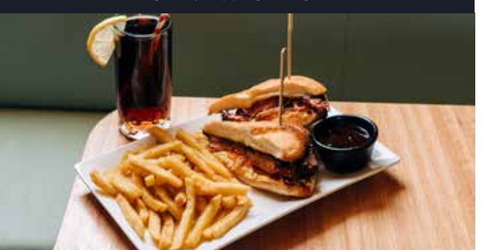
SMOKED BRISKET PO' BOY + FRIES Sandwich classic stuffed with smoked beef brisket slathered with spicy mayo, and piled with cheese, lettuce, tomato and pickles. Served with fries.