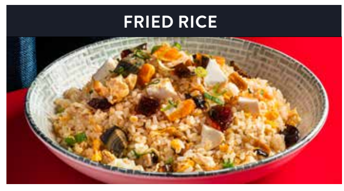
THREE KINDS OF EGGS FRIED RICE Wok fried short grain rice with three kinds of eggs (egg, salted duck egg and century egg).