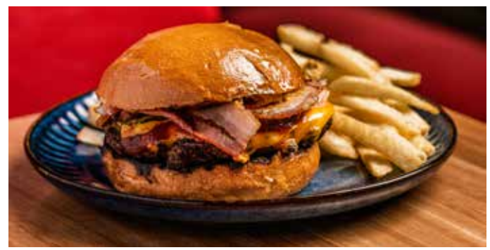
BACON CHEESE BURGER + FRIES Juicy beef patty topped with bacon and cheese and served dressed in a soft burger bun with fries.