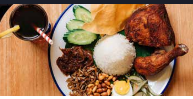
NASI LEMAK WITH FRIED CHICKEN Fragrant coconut rice with crispy anchovies, cucumbers, boiled eggs, peanuts, sambal onions with our fried chicken Maryland and served with a papadam.