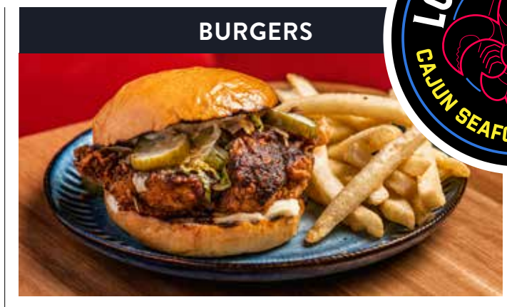
CRUNCHY CAJUN CHICKEN BURGER + FRIES Battered chicken coated with southern spices and deep-fried till crunchy. Served dressed in a soft burger bun with fries.